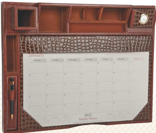
Product No. Table Planner Big Spl. with Box