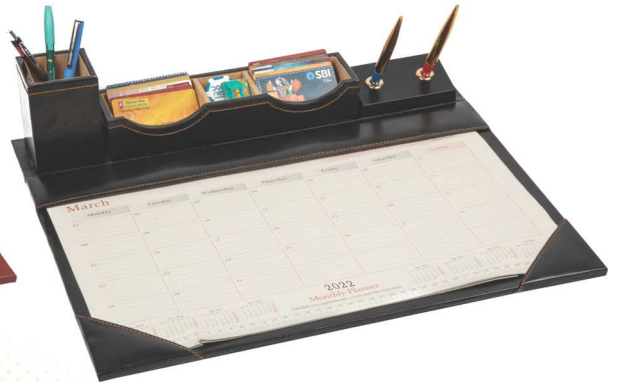
Product : Table Planner Small Spl. with Box Available in Black & Tan