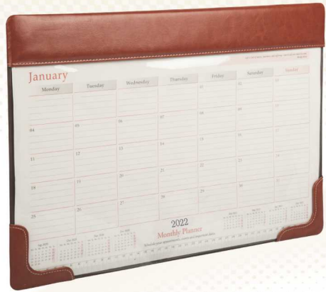
Product : Small Table Planner Leatherite Product : Big Table Planner Leatherite